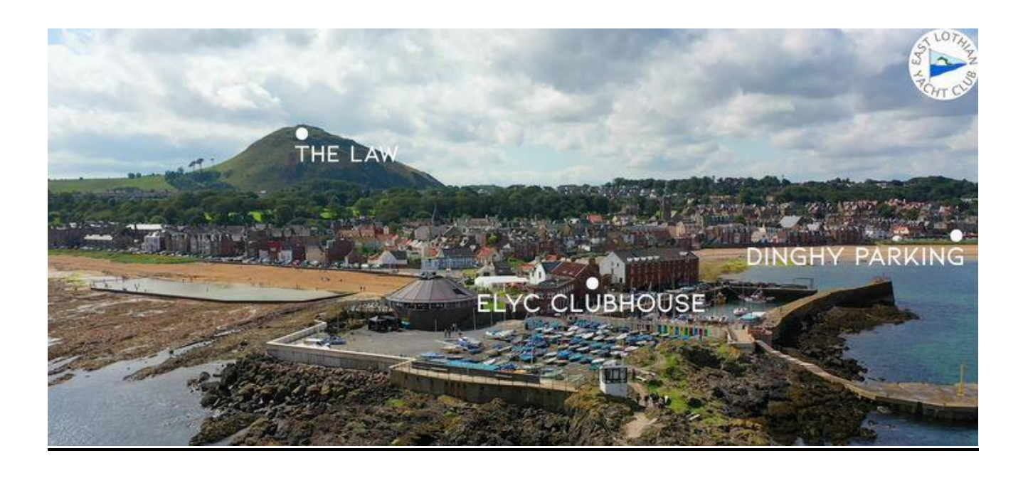
Good luck and have a great week!